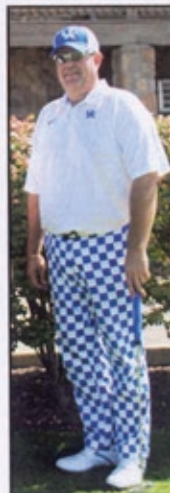
"Golfing in Style."

Midway College of Pharmacy Citizens National Bank Pathology & Cytology Laboratories Chandler's Plywood Products