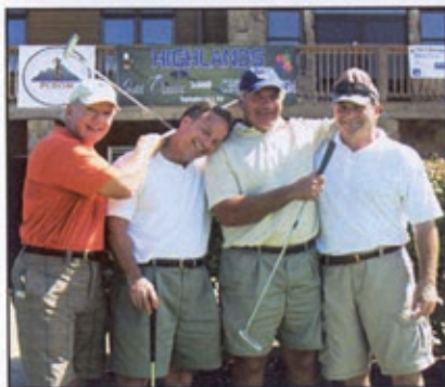
"Golf is fun!"