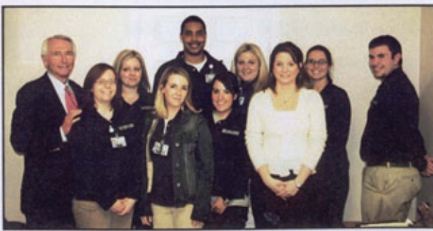
Governor Steve Beshear visited with staff and students at the Highlands Center for Autism.

Highlands Center for Autism is the only center based program in Kentucky using ABA in a clinical educational setting. Since its opening in July 2009, the Center for Autism has seen remarkable progress. The most pressing need at this time is for scholarships to allow many of the over 100 deserving children on the waiting list an opportunity to attend the program. Simply put – we need your help. All proceeds from the 2011 Golf Classic, after tournament expenses, will be used for scholarships. Your participation in the Golf Classic will help provide a positive change in the life of a child with autism.